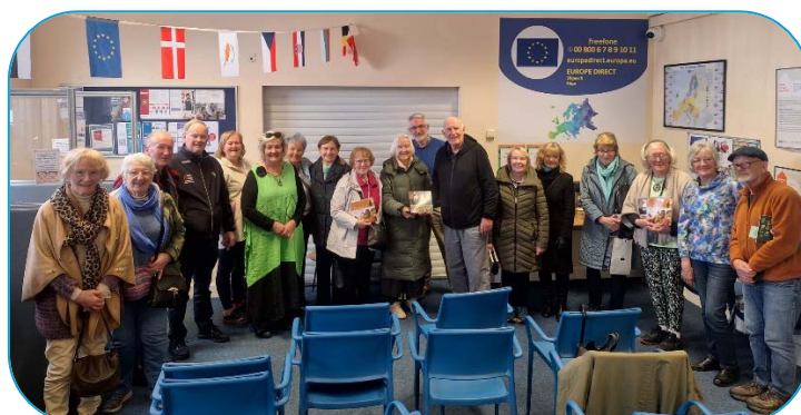
Déanann leabharlann Shligiúgh ceiliúradh ar SnG le roinnt ócáidí agus aíonna speisialta

Buíochas d'achan duine a tháinig isteach chugainn le Seachtain na Gaeilge a cheiliúradh i mbliana.