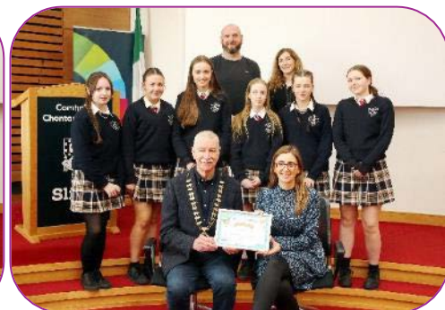
Daltaí as Aonad Loch Gile, Coláiste na Trócaire Lá Mór na Gaeilge Chomhairle