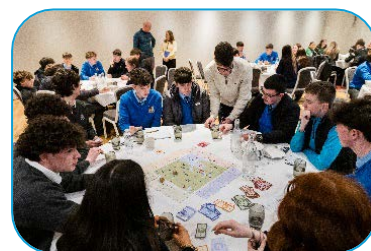
Climate Education Clubs Celebration