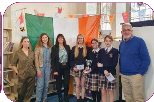
Tráth na gCeist Winners Aonad Loch Gile