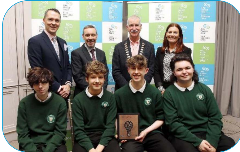
Student Enterprise Awards Overall Winner Senior Category - 'Duffmeister' - Ballinode College