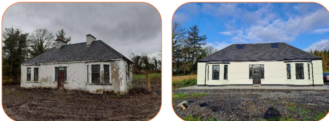
Vacant Property Refurbishment Grant (Before and After)

This scheme provides people with a grant to support the refurbishment of vacant proposed properties. Since its original launch in July 2022, Sligo County Council has received a total of 410 applications with 330 grants being approved (up to 6 th March 2025).