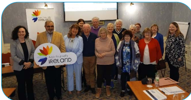
Training for Older Persons Council Chairs

Training for Chairs of the Older Persons Council across the north western region took place in Carrick on Shannon on 19 th March with Sligo members in attendance.