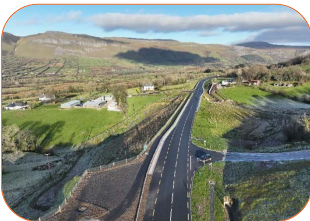
N16 Mainline at Lugatober

The new N16 Lugatober road and its associated active travel facilities are now open to the public. There are some outstanding elements and works of a seasonal nature. These works will be completed over the coming months. On completion, the project will be entering Phase 7 – Close Out and Review.