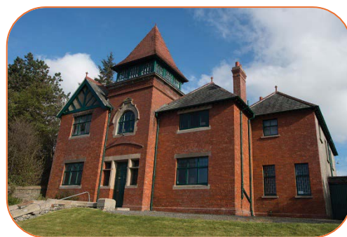
Sligo Masonic Hall

Under BHIS 2025 and BHIS Thatch 2025, a total funding award of €183,295 has been allocated to Sligo projects as follows: €165,743 for 15 projects (BHIS 2025) and €17,552 for 2 projects (BHIS Thatch 2025). Project details were circulated to Members by email on the 18 th February 2025 and all grant applicants have been notified.