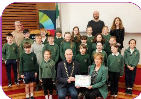
Daltaí as Gaelscoil Chnoc na Ré, Lá Mór na Gaeilge Chomhairle Chontae Shligigh