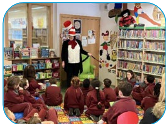
Scoil Mhuire gan Smál

World Book Day: Primary Schools who visited Sligo County Libraries to celebrate World Book Day on Thursday 6 th March, included Sooeey National School visiting Sligo Central Library, Holy Family NS visiting Tubbercurry Community Library and Scoil Mhuire gan Smál visiting Ballymote Community Library. Library staff also visited schools and preschools, including St. Paul's NS Collooney, Réalt na Mara NS Rosses Point, and Tubbercurry Family Resource Centre.