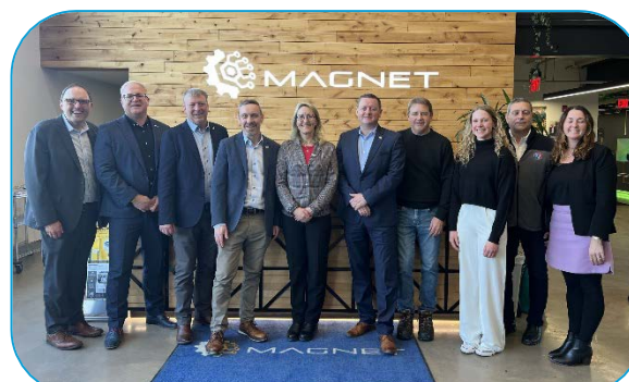
Visit to Magnet Manufacturing facility in Cleveland

Visit – A joint delegation from Sligo County Council and Sligo Chamber of Commerce visited the City of Mentor, Cleveland and Philadelphia and met with port authorities, manufacturing businesses, Chambers of Commerce, and economic development agencies. A delegation from Mentor will be visiting Sligo on 2 nd April and meeting with local business to discuss how they can enter the US Market.