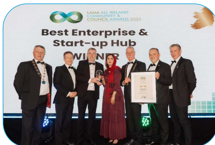
AIM Centre wins the 'Best Enterprise & Start-Up Hub' award at LAMA

LAMA Awards – The AIM Centre won the 'Best Enterprise & Start-Up Hub' award LAMA All Ireland Community & Council Awards on 22 nd February.