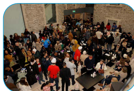
Sligo PPN Plenary