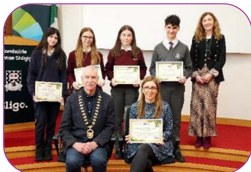
Buaiteoirí Scoláireachtaí Chomhairle Chontae Shligigh

Sligo County Council marked Seachtain na Gaeilge 2025 with an array of events across the county. Seachtain na Gaeilge le Energia which runs annually from 1-17 th March is one of the biggest celebrations of our native language and culture that takes place nationally and internationally. The festival gives an opportunity to everyone to practise an teanga, whether a fluent speaker or a learner. Sligo County Council, in conjunction with a number of local Irish language groups devised a programme of inclusive events for all age groups and language capabilities.