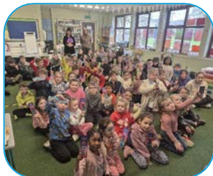
St Pauls NS Collooney