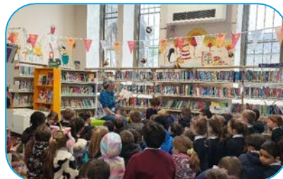
Sooeey National School