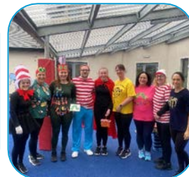
Tubbercurry FRC staff