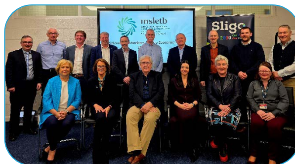
Members of the Sligo Economic Forum at the MSLETB Training Centre, Ballytivnan

Sligo Economic Forum – The Quarter 1 Meeting of SEF focused on skills and training resources for the North West with a visit to the MSLETB Training Centre at Ballytivnan and presentations on the range of services provided by MSLETB, North West Regional Skills, and the positive experience of a qualified apprentice. Dissemination of information from the Forum to be reviewed at next meeting.