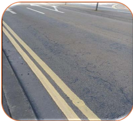
N4 Inner Relief Road – Pavement showing rutting and cracking in wheel tracks, with significant wear on antiskid surface.

Design of the N4 Inner Relief Road Pavement Resurfacing project was completed and contract documents were compiled. The project was tendered in March 2025, with award and delivery planned between Quarter 2 and Quarter 4 2025, subject to funding and resources.