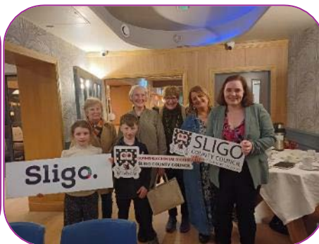
Members of Grúpa Gaeilge Inis Crabhann, Tráth na gCeist, Ocean Sands Hotel