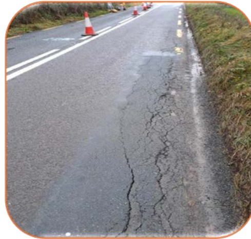
N16 Lugatober to Co. Boundary – Significant structural distress in the nearside edge and wheel track.

In house design work is ongoing for the N59 Tullylin to Fiddaun pavement scheme, which is scheduled for delivery in 2026, subject to funding and resources.