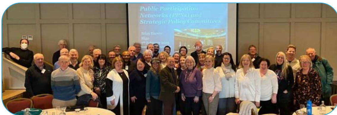
North West Regional Training